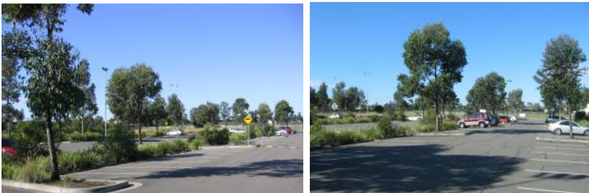
Figure 7: Landscaping within car park providing shading for vehicles and visual relief of car parking areas.