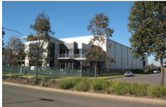
Figure 6: (Top Right: Warehouse distribution building with two-storey ancillary offices on the front facade)