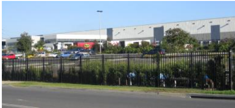
Figure 9: Palisade fencing