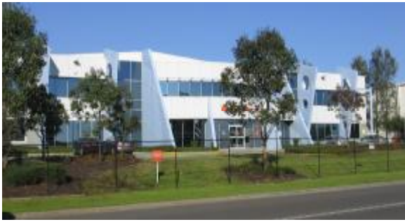
Figure 3: (Top Left: Two storey ancillary offices with strong vertical fin wall projections in front of a factory / warehouse building)