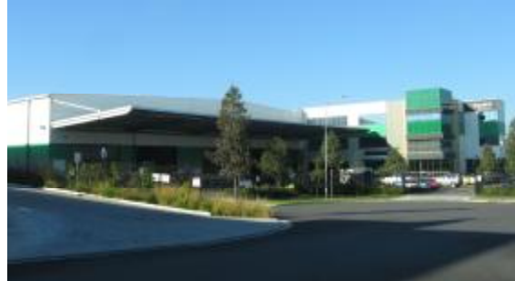
Figure 1: (Top Left: Warehouse distribution building with varied architectural elements, varied external finishes and ancillary offices located on the front façade of the building)