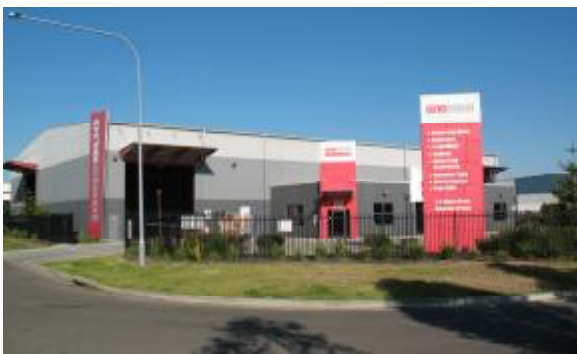
Figure 5: (Top Left: Factory / warehouse distribution building with horizontal colour banding on the building elevations with advertising signage matching the key vertical front façade element)