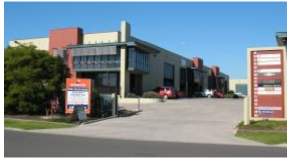
Figure 4: Top Right: Two storey ancillary offices on the front façade of a warehouse distribution building and vertical architectural elements along the building)